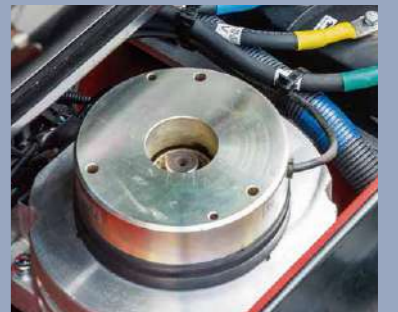
Electrical Park Brake (EPB) system