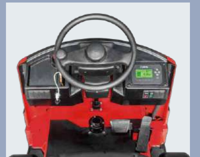
Modern outline design with LCD instrument and USB charging port