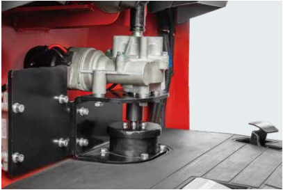
Electronic power steering system (for stand-up driving type tractor)