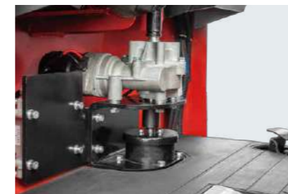
Electronic power steering system (for stand-up driving type tractor)