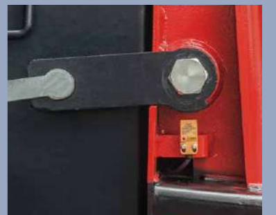
The locking device of the battery is provided with the safety protection function. Only if the locking device is rotated in place, the tractor can travel