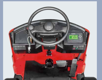
Modern outline design with LCD instrument and USB charging port