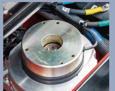
Electrical Park Brake (EPB) system