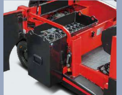
Battery side roll out is taken as the standard configuration in order to easily and fast replace the battery