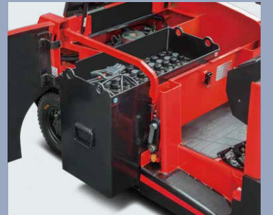
Battery side roll out is taken as the standard configuration in order to easily and fast replace the battery