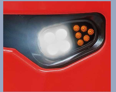
Reliable LED lighting