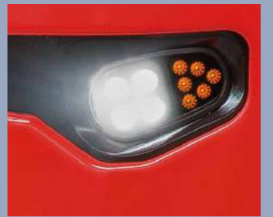
Reliable LED lighting