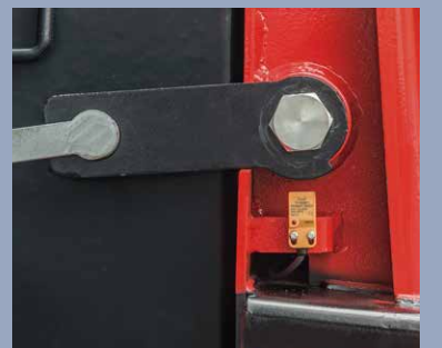
The locking device of the battery is provided with the safety protection function. Only if the locking device is rotated in place, the tractor can travel